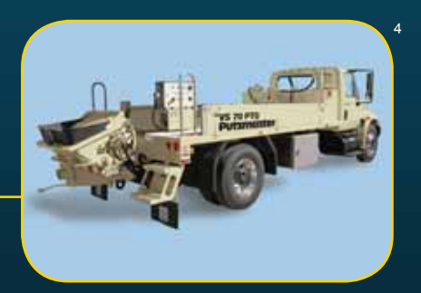
VS Series • Vehicle Mounted Refer to separate specification sheet.