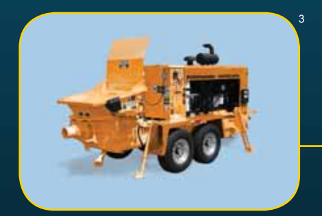
BSA 100 Series